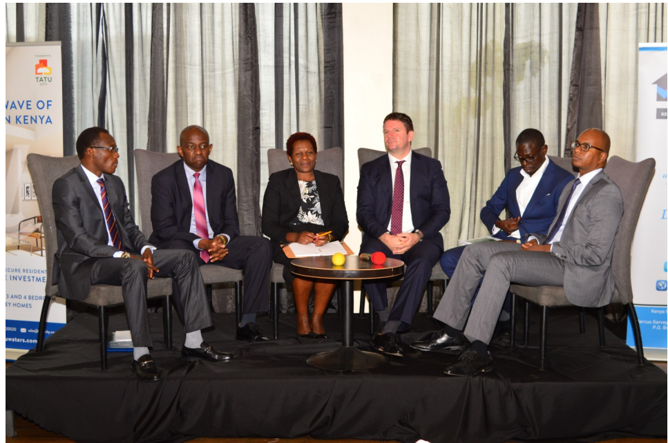
KPDA CEO BREAKFAST FORUM PANELISTS.